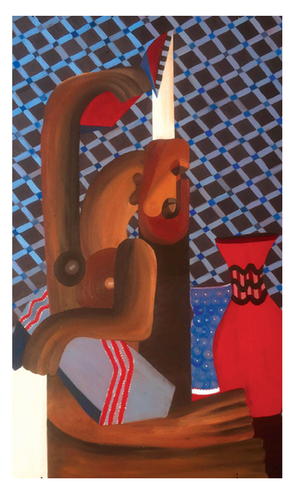
Painting by Lidia Sciarrotta, 2020

Together offering a space for naming harmful practices and rebuilding again through collective learning, knowledge exchange and healing.