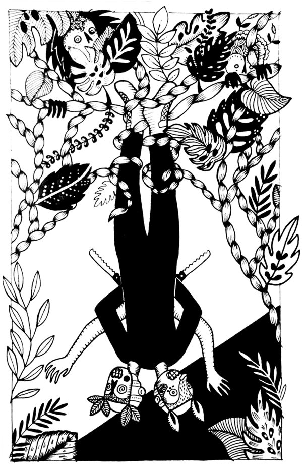
Marion Aland, 2020

Following the call of the RESHAPE Network to reimagine alternatives for the European arts ecosystem – specifically fairer governance models – we built a collective proposal for action underpinned by a new paradigm. It is built from the bottom up, informed by artists' and art workers' practice through a sensitive co-writing process. Starting from our specific Western European context, this material is limited to this subjectivity, but it is shaped in affinity with many other voices and informed by a wide range of knowledge and intuitions. As with all movements, it is on the way and unfinished by nature.